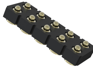
Housing W/Double Rows