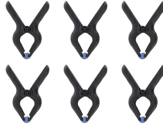
Large 6 Pieces Nylon Grip Clamps Set