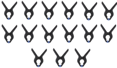
Small 15 Pieces Nylon Grip Clamps Set